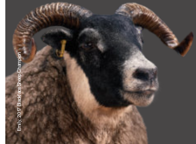
Emily, 2017 Blackface Sheep Champion